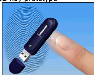
*USB key prototype